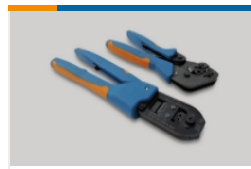
Hand Crimping Tools(2)